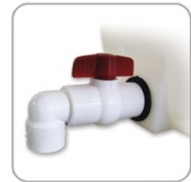
Gravity Offload Valve