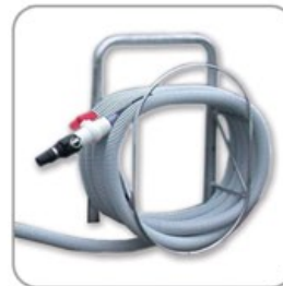
Heavy Duty Hose Rack