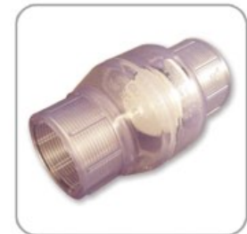
Clear Swing Check Valve(s)